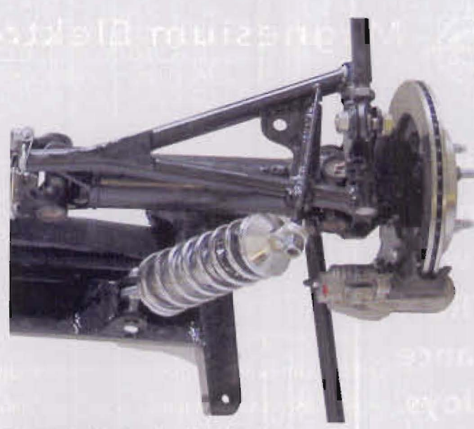
An example of Arning's four-link IRS with built-in steer action

Total Performance' was the brainchild of Lee lacocca and the shot of adrenalin that Ford's stodgy image needed.