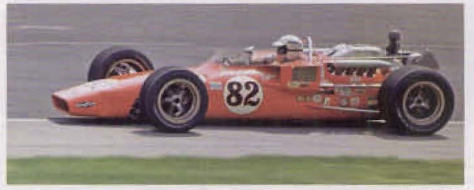
A) Foyt's winning Coyotes also used Arning's independent rear suspension

One of the more bizarre projects to cross his path was a special limousine being built for the President of the United